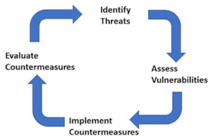
Figure 1: Risk Management Cycle

The methodology defines risk as the product of two factors: