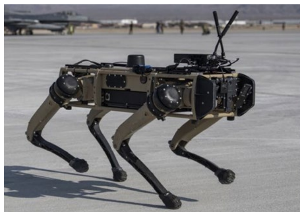
Figure 2 – Ghost quadruped robotic dog

RAS may benefit. Equally, in healthcare, autonomous systems can improve survivability and reduce human risk when extracting casualties from the battlefield via crewless vehicles, in addition to reducing cognitive load in high-pressure environments of severe trauma management. Rapid evacuation and protection during transportation when injured on the battlefield are inherent in protecting the fighting force.